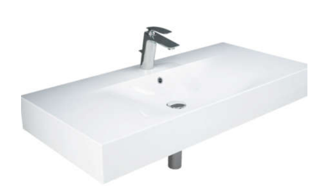
Faucet not included